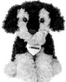
Beemer is modeled after the real-life Schnauzer mix providing pet hugs to those in need.

To learn more about pet therapy or to find out how you can help further the mission of spreading pet hugs around the country, visit purinapetlover.com .