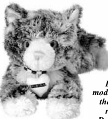
Ducati is modeled after the real-life rescue cat Ducati, who has helped hundreds of children with the ARF therapy team.